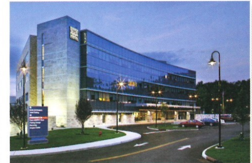
Just 6 miles from The Hudson Valley Hospital Center