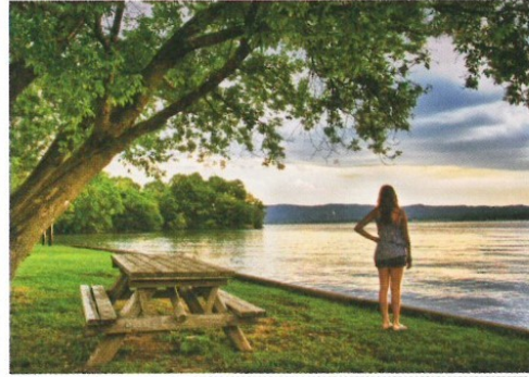
Georges Island Park