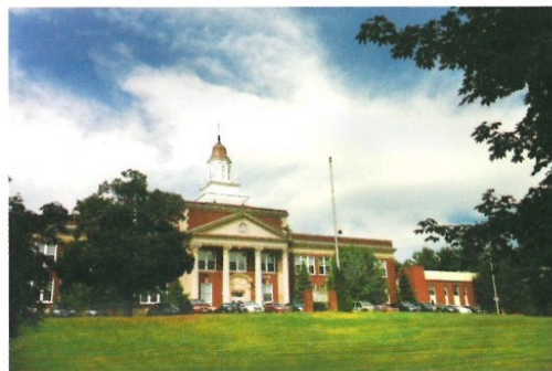
Hendrick Hudson High School