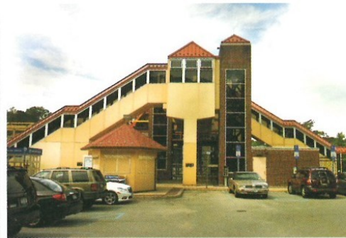
The Cortlandt Metro-North Railroad Station