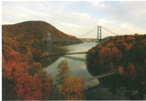
The Scenic Hudson River Valley

Roundtop Commons is just 6 miles from The Hudson Valley Hospital Center and 1.5 miles from the highly regarded Hendrick Hudson High School. The Hendrick Hudson Free Library and many recreational soccer and softball fields are just minutes away.