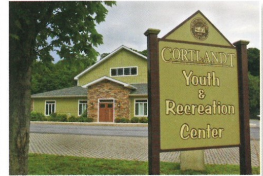
Cortlandt Youth & Recreation Center