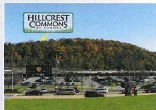
Carmel Shoprite Shopping Center