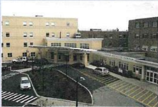
Putnam Hospital Center

Hillcrest Commons is just 4 miles from The Putnam Hospital Center (PHC) and the Mount Kisco Medical Group and the Putnam County Office of the Aging is also close by. Beautiful Lake Gleneida and many other outdoor recreational and sports facilities are just minutes away.