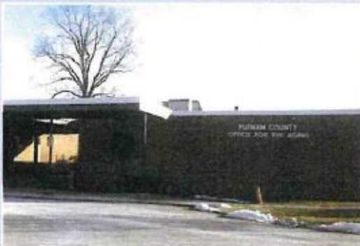
Putnam County Office of the Aging