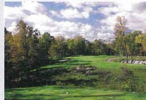
Centennial Golf Club