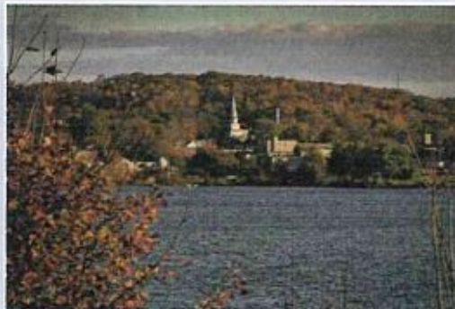
Town of Carmel